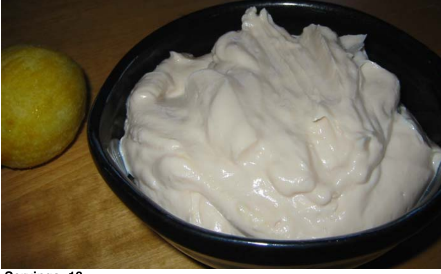
Servings: 18 Preparation Time: 5 minutes