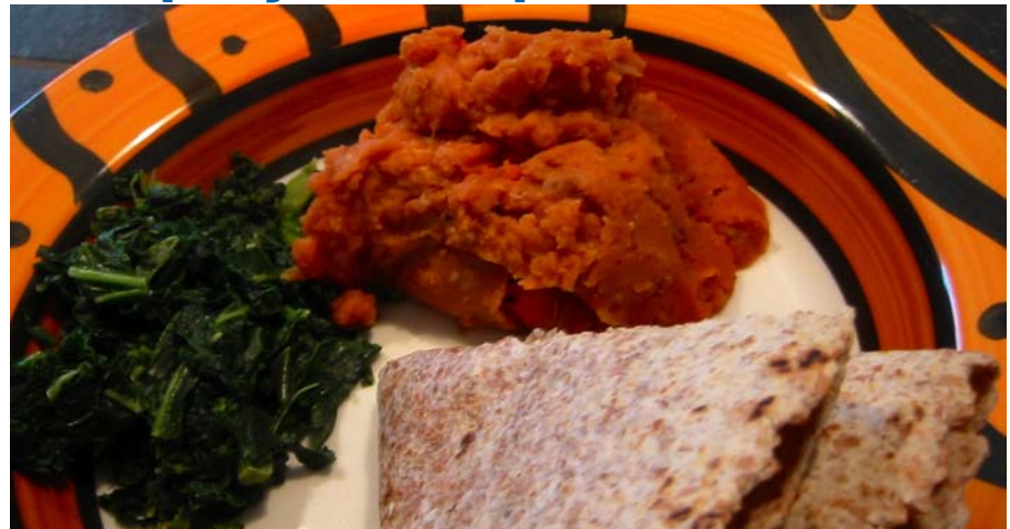
Servings: 8 Preparation Time: 25 minutes