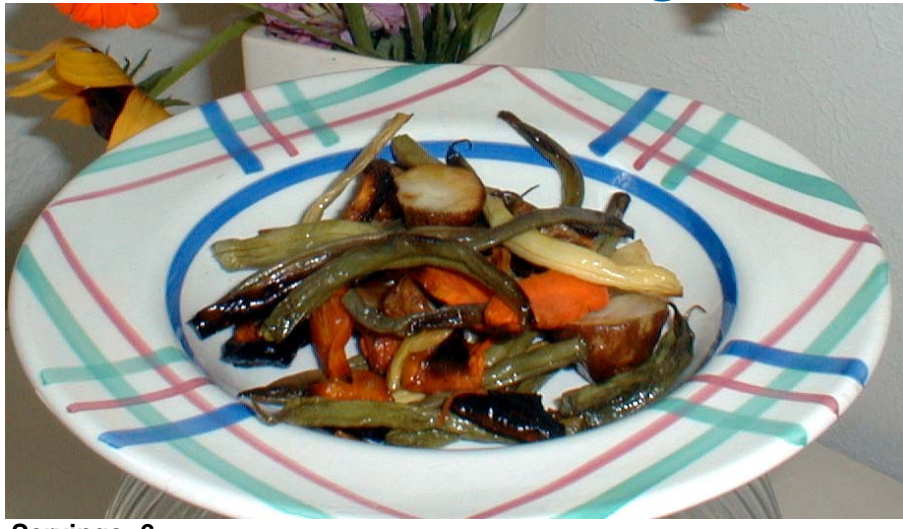
Servings: 6 Preparation Time: 40 minutes